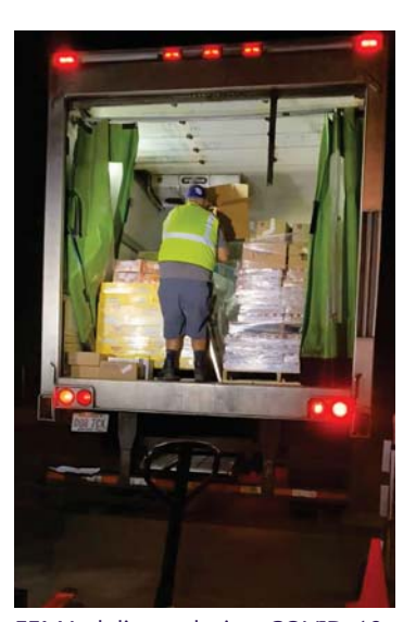
FEMA delivery during COVID-19

ask for support before, and, as a result of economic fluctuations, business closures, slow re-openings, layoffs or furloughs, sick leave, unforeseen medical expenses, and other interruptions to previously steady income, they are calling upon their local food bank as never before. We know it's not easy to ask for the help. We are just glad we are here and able to stock our shelves when people are in need.