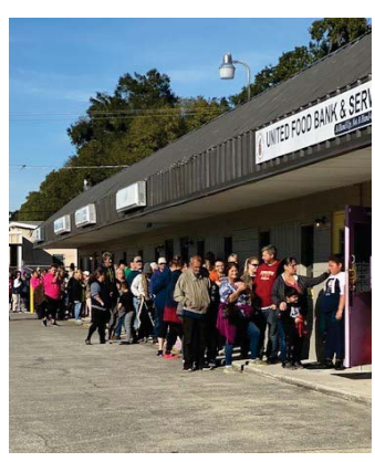
UFBPC Thanksgiving 710-meal basket distribution in 2019