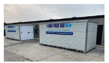
Two temporary storage units at UFBPC

Aside from the pandemic, the local area has a high number of Asset Limited, Income Constrained (but) Employed or otherwise known as ALICE individuals. These are people who are above poverty but can't